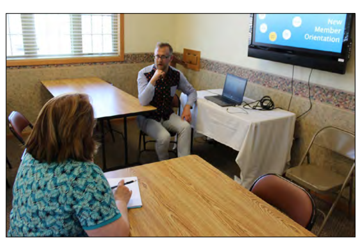
New Member Orientation - August 1