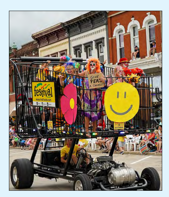
BE SURE TO MARK YOUR CALENDARS FOR NEXT YEAR'S PARADE SATURDAY, JULY 18, 2020!