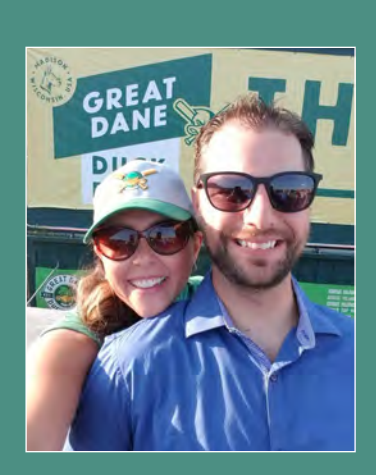
The BACC takes over the Duck Blind! PAGE 3