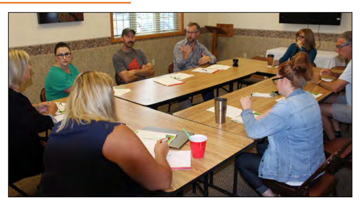
Brand Committee meeting - August 12