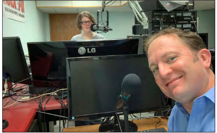
On the air with 99.7 MAX FM • Oct. 21