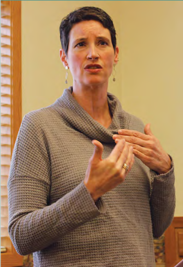
Gateway Metabolic Weight Loss Lunch & Learn • October 24