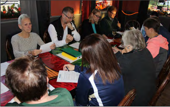
Ambassadors Club meeting at T-bird Lanes • Oct. 14