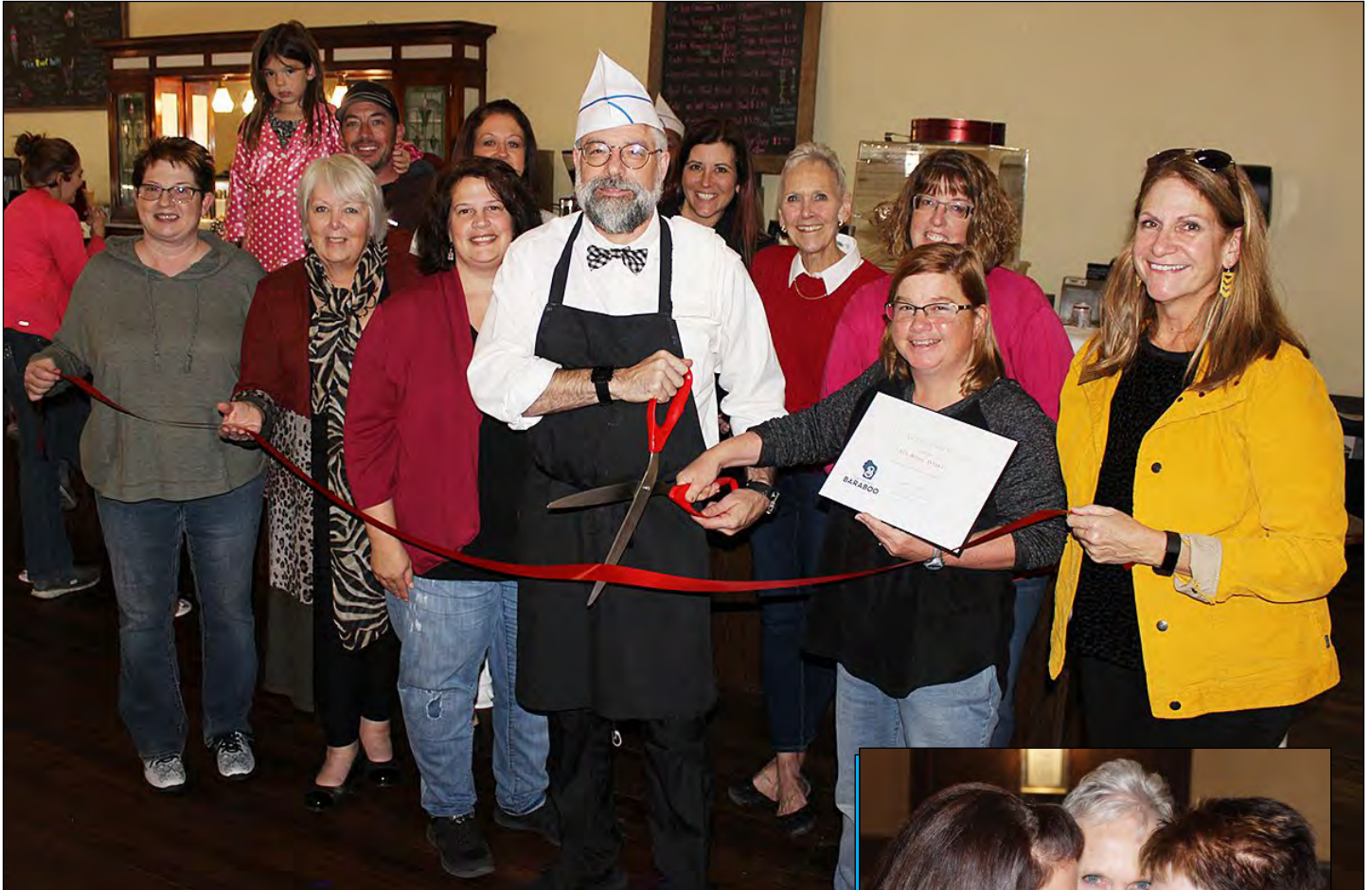
Tin Roof Dairy was officially welcomed into the Chamber on October 18 with a ribbon cutting at its Third Avenue location. Tin Roof is an old-fashioned, 1930s-style ice cream parlor.