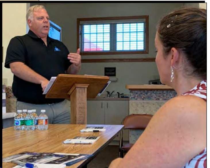
Trinity Gunshot Alarm System training September 30