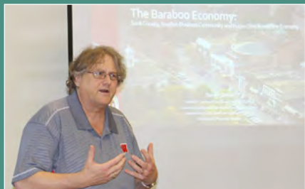
ECONOMIC FORECAST SUMMIT/2