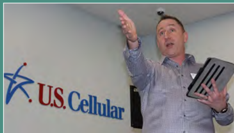
BUSINESS AFTER 5 AT CELL.PLUS/4