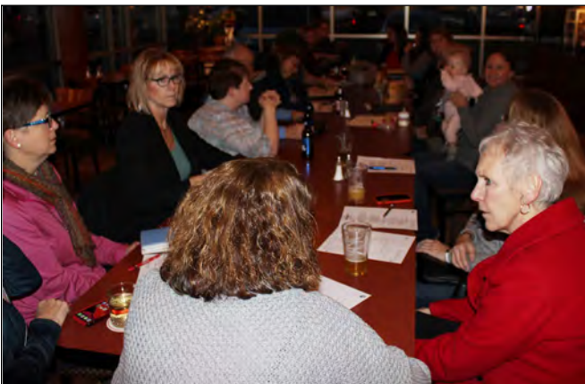
Ambassadors Club meeting at Glacier Rock • Feb. 24