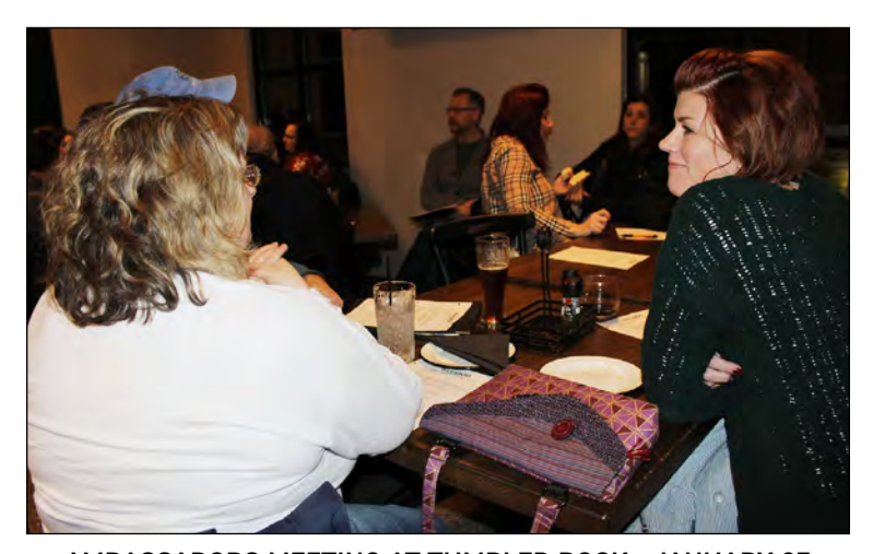
AMBASSADORS MEETING AT TUMBLED ROCK · JANUARY 27