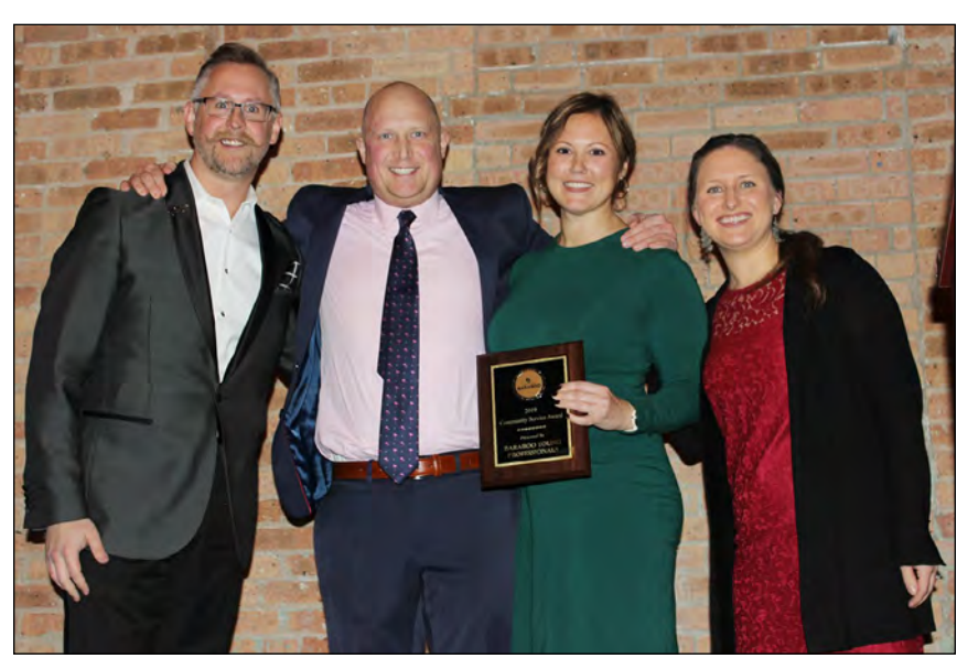
^ COMMUNITY SERVICE AWARD: BARABOO YOUNG PROFESSIONALS