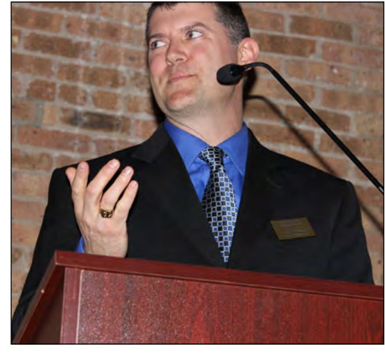
^ TOURISM AWARD: DEVIL'S LAKE STATE PARK < BUSINESS OF THE YEAR: COFFEE BEAN