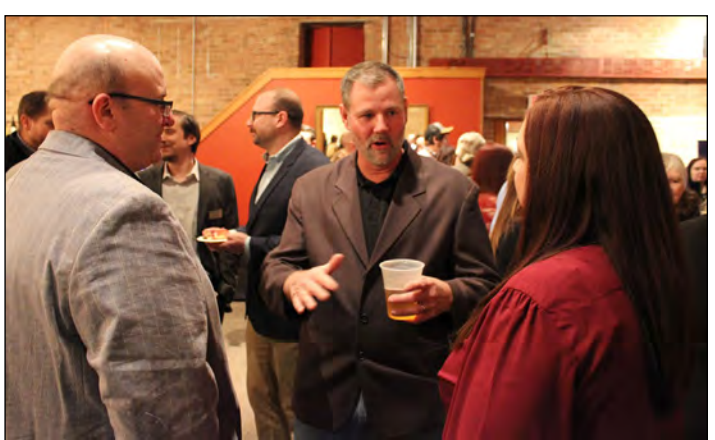
Some 270 members attended the Chamber's Annual Meeting and Dinner on January 16th, enjoying food and drinks from several member businesses before the program and awards.