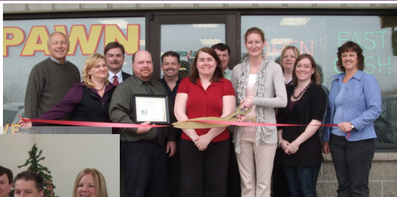
Check Advance & Pawn