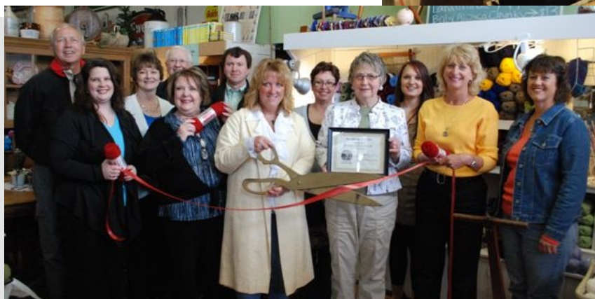
Oak Street Antiques and Yarn