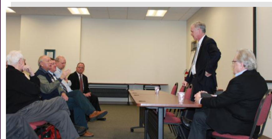
The Senator listened to questions and concerns.