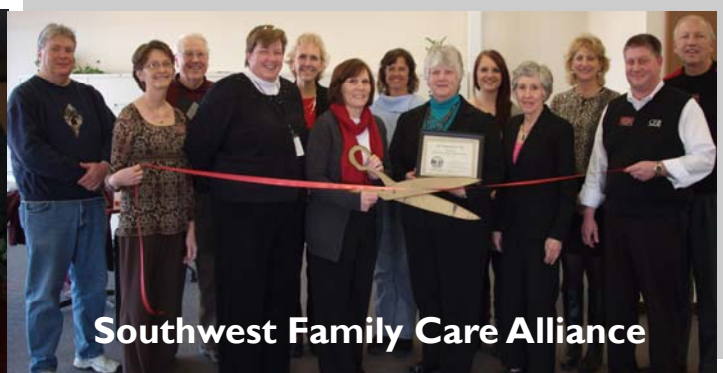
Southwest Family Care Alliance