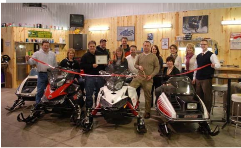
Baraboo River Runners